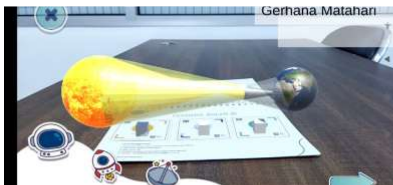
Figure 5. Augmented reality display

Color selection is crucial when creating the visual appeal of applications and marker books since it can influence how someone perceives information 10 . It becomes an intriguing color combination when white, blue, and green are combined. Additionally, consider selecting ornaments that fit the lesson's overall subject. An animated 3D item will appear when the camera is pointed at a specific marking book. The view of augmented reality is shown here.