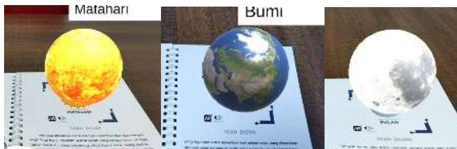
Figure 2. Display of 3D Objects

The AR menu is quite crucial in this application since it uses Augmented Reality technology to show 3D things when the solar and lunar eclipses are happening. The sun, earth, and moon are shown as three-dimensional (3D) objects.