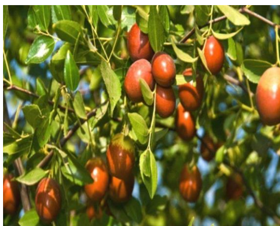
Picture 1. Bidara plant and Taksonomy

Kingdom : Plantae Clade : Angiospermae Clade : Eudikotil Clade : Rosids Ordo: : Rosales Family: : Rhamnaceae Genus: : Ziziphus Spesies: : Z. jujuba